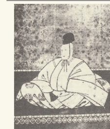
Excerpted from the "Wakayama Shiyo" (Wakayama Historical Record).